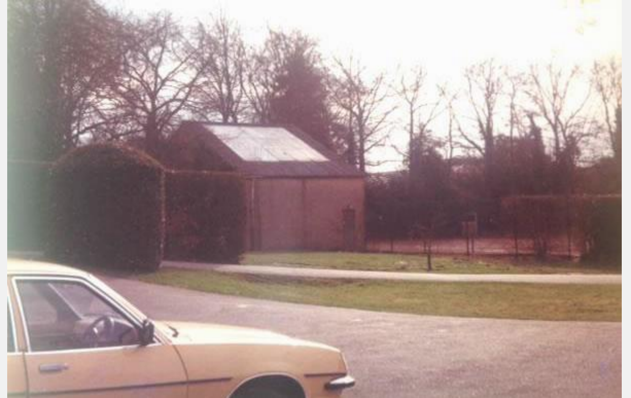
Original squash court built on the current (2014) gravel car park

1946 Squash was becoming a fast-growing sport, and the first Squash court was constructed near the site of the Indoor Sports Hall.