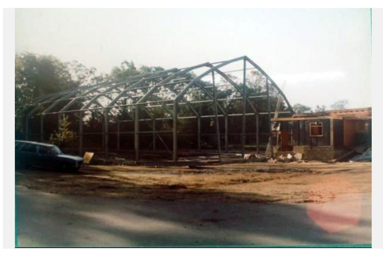
Construction of the new sports hall