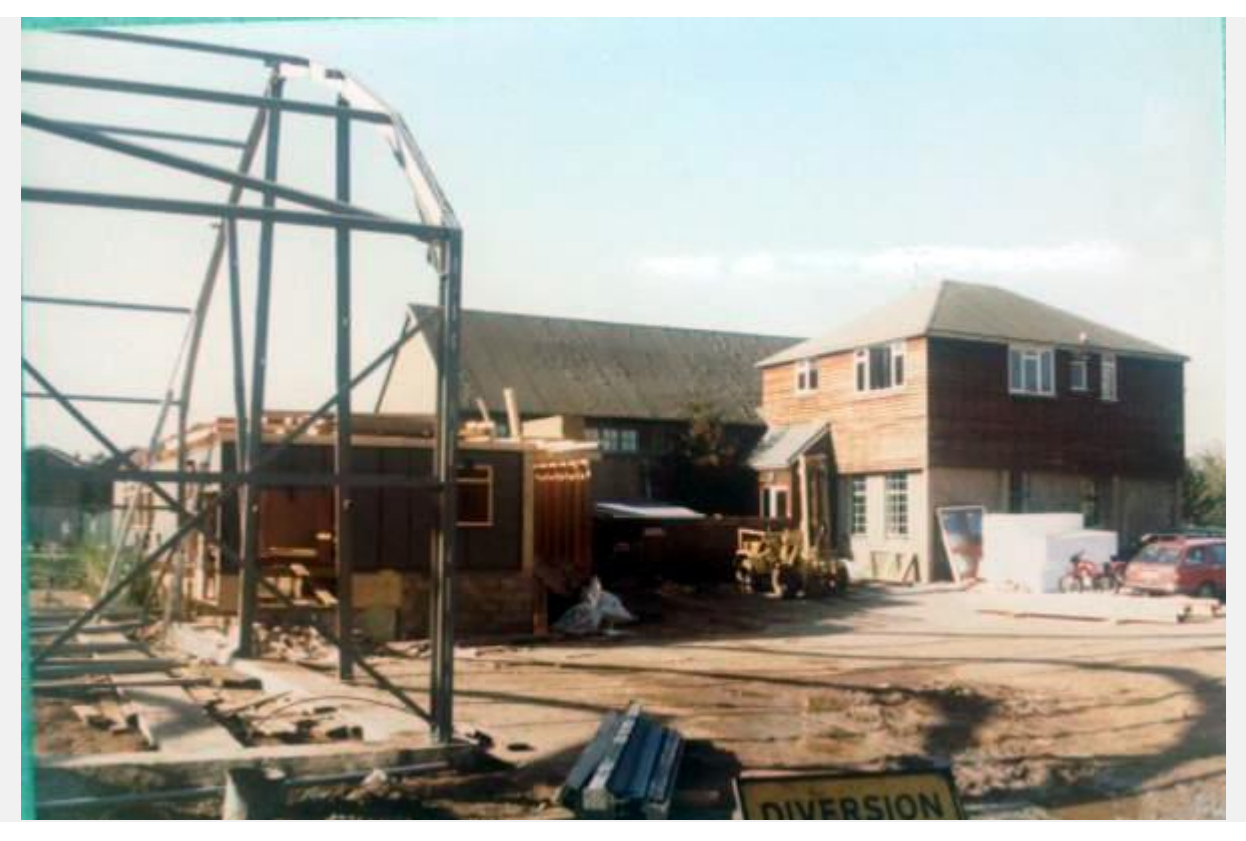
Construction of sports hall and new lounge, office and entrance