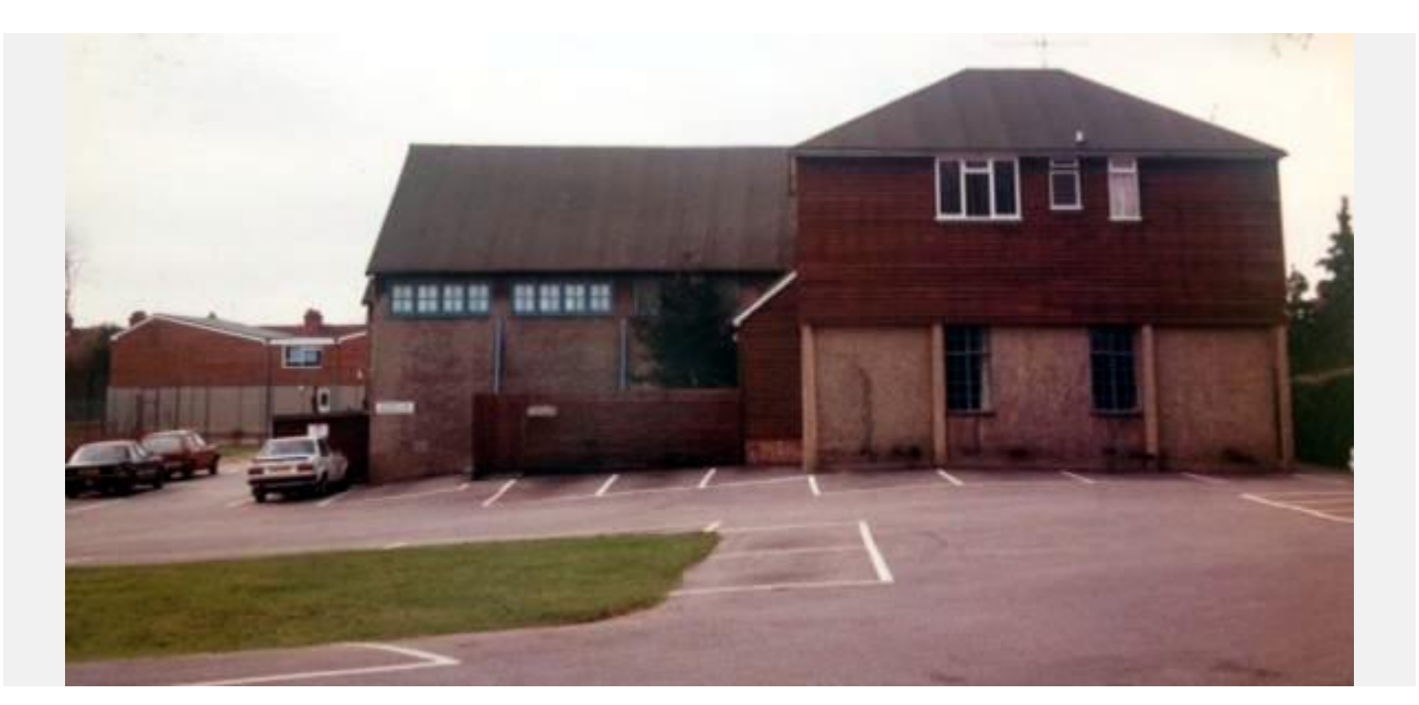
View of Old Hall, Bridge room and Steward's flat