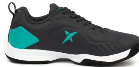
Eros B XT Shoe