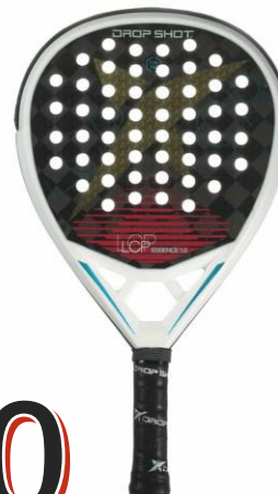
ESSENCE 1.0 PADEL RACKET

A Yukon Pro 1.0 Drop Shot that has a teardrop format in its conception, a medium-high balance shifted towards the head of the blade and a striking zone that is more than remarkable given its characteristics. A responsible shovel with control while still being powerful.