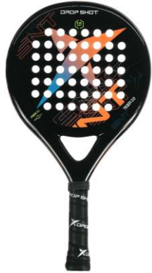
Tiger 2.0 Childs Racket