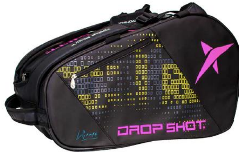
Lyra Padel Bag