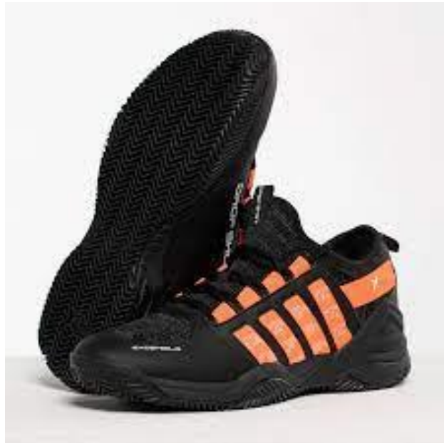
X-Celerator XTW Shoe