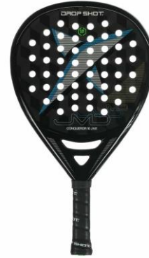
CONQUEROR 10 Junior Racket