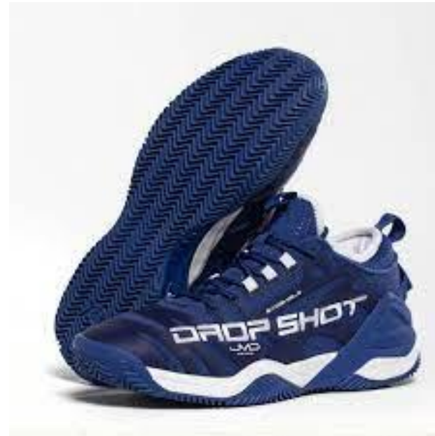
Argon 2XTW Shoe