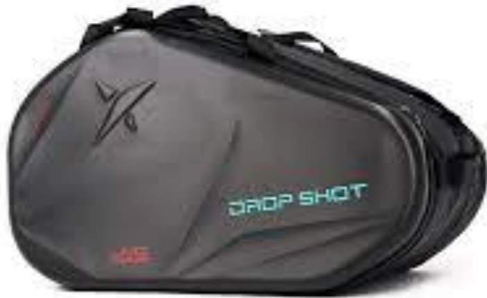
Mylar Padel Bag