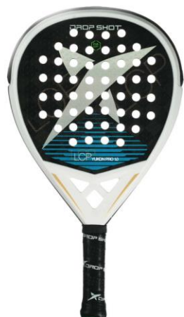
YUKON PRO 1.0 PADEL RACKET