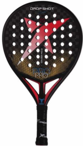
EXPLORER PRO 4.0 PADEL RACKET